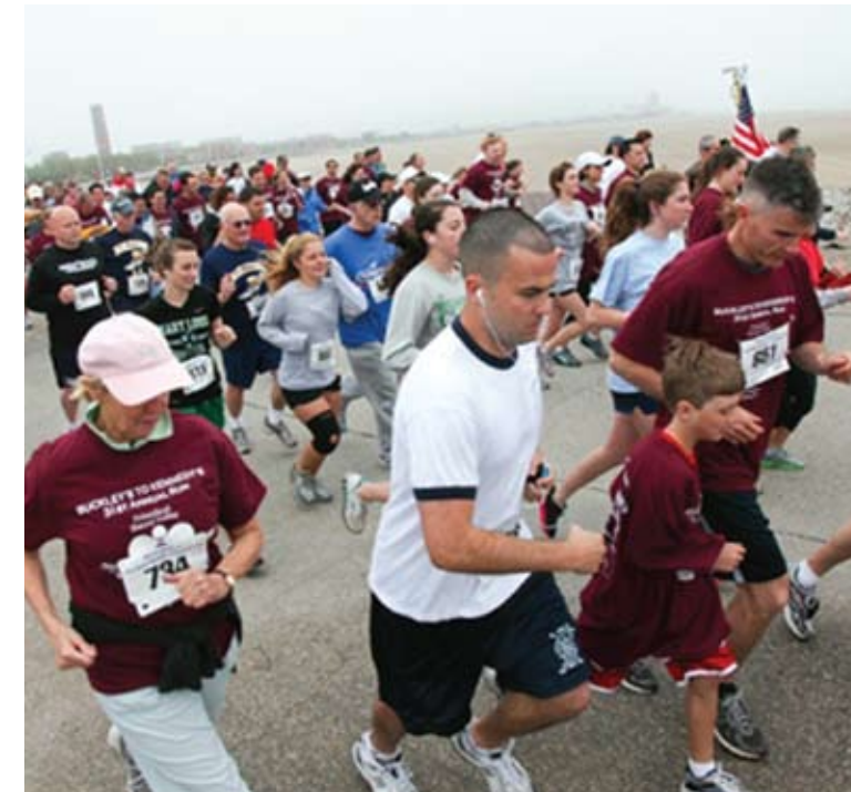
Hundreds of runners laced up their sneakers to support the annual Buckley's - Kennedy's Run which raised over $90,000 for HeartShare's programs.

The Spring Gala and Auction was just the beginning of an eventful spring. From the Buckley's - Kennedy's 5K Charity Run to the Golf Classic to the Education Services and Family Support Dinner Dances, HeartShare had it all.